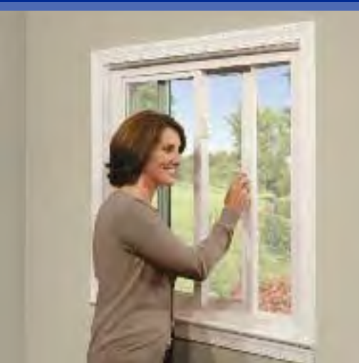
Window World Sliding Windows make cleaning a snap.