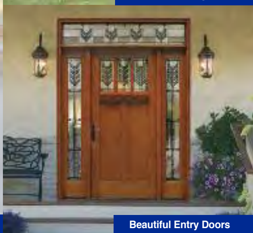
Beautiful Entry Doors