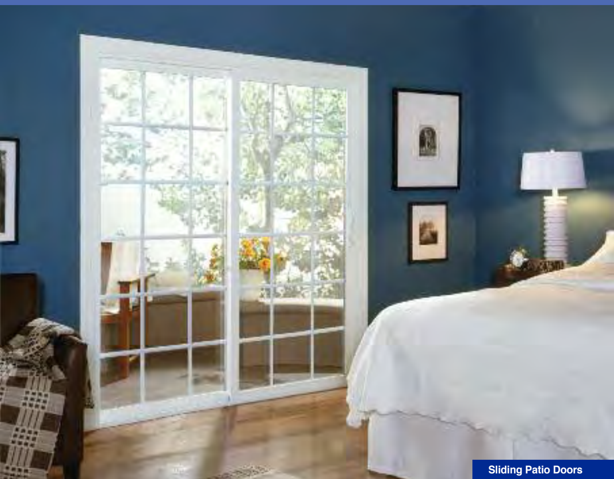
Sliding Patio Doors